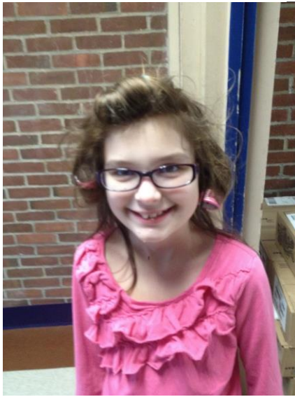
Fashion Disaster Day brought a collection of mismatched outfits and unforgettable hairdos!