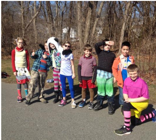
These 'spirited' fifth graders enjoyed the beautiful weather during recess. It was a perfect 70 degree February day! Students were required to design collaborative, inclusive games for others to play.